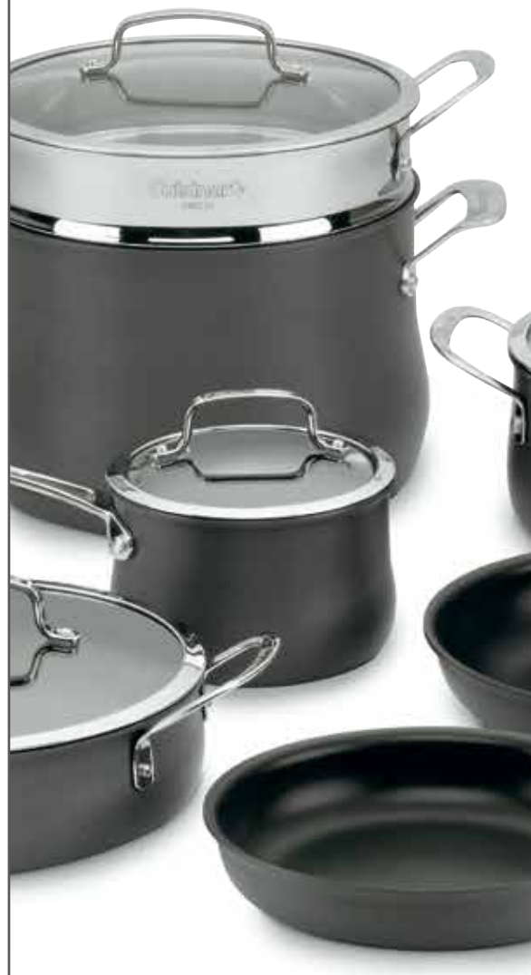
Cuisinart® Contour Hard Anodized Cookware